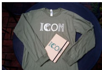
ICON logo used for fundraising & promotion