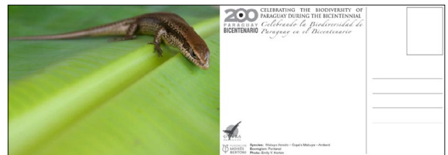
Postcards for Paraguayan biodiversity photo exhibit.