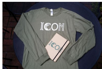
ICON logo used for fundraising & promotion